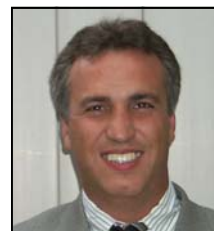
By Michael Gadaleta

If you expect to be laid off or out of work for an extended period of time, freezing your union book is a good way to save money. As all Local 94 members should know, obtaining a withdrawal card is an option that is available during layoffs or when the closing of a shop occurs. Obtaining a withdrawal card frees you from any obligation to pay union dues while you are out of work. If you fail to obtain a withdrawal card while you are out of work, you remain responsible for your union dues. Failure to pay your union dues when you are out of work can result in being suspended from the union and having to pay back dues. Of course once you return to work you must submit your withdrawal card to the Local 94 Dues Department. If you have any questions, call Local 94 at (212) 245-7040.