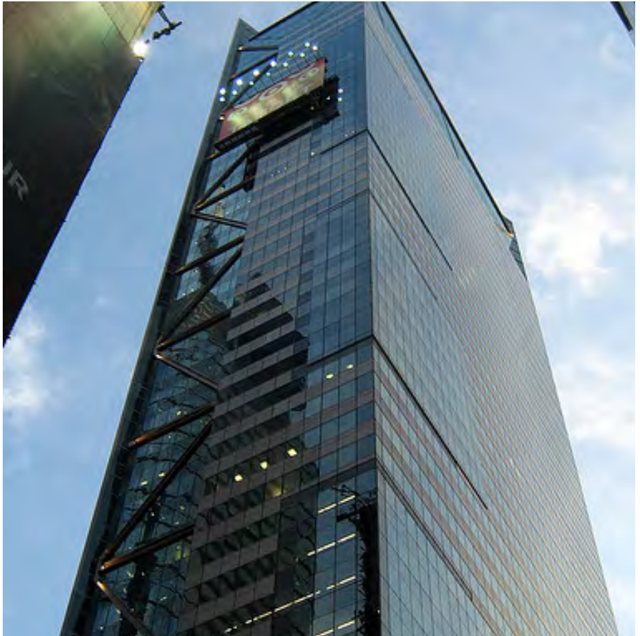
7 Times Square

Being connected and monitored in this way, all thermostats can "see" once the desired temperature is satisfied, and will slow down the fans by as much as 50 percent or more, saving massive amounts of energy. The building's five cells are responsible for producing the more than five thousand gallons of air conditioning that is used in the building. By the middle of the day, this state of the art system allows electricity usage to drop by half. Before 10 a.m. on a stifling June day, the machines were