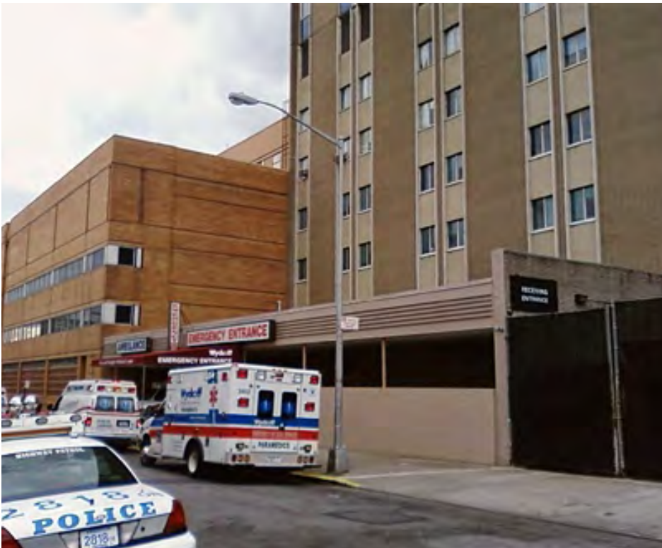
Local 94A members take great pride in keeping Wyckoff Hospital running.

where eighteen individuals meet every morning and don uniforms to become part of a truly amazing team. We're not just changing light bulbs! The pace and the job can change here in a moment's notice, sometimes without mercy as in all emergency situations where it's understood that performing above and beyond