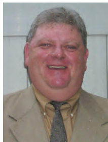
BY RAY MACCO AND JACK REDDEN, SCHOOL DELEGATES

O n September 1st and September 2nd TEMCO employees who worked during the period July 1, 2008 through June 30, 2009 came to I.U.O.E. Local 94 to pick up their retroactive payroll and benefit checks.