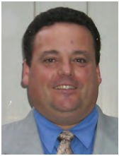
BY THOMAS HART, COMMERCIAL DELEGATE

Up until August Of 2010 for many of us obtaining one of the four LEED (Leadership in Energy and Environmental Design) certifications, Standard/ Certified, Silver, Gold or Platinum was reserved for the newer generation of building we are seeing built today.