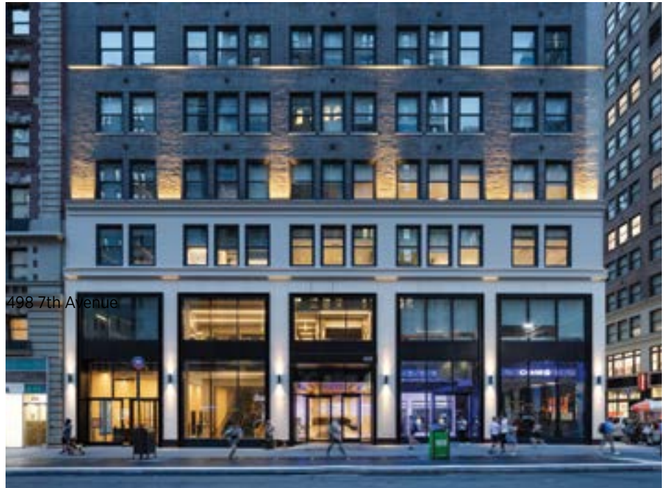
498 7th Avenue

Throughout all the newly built spaces there are VAV boxes which are aimed at conserving energy. Speaking of energy savings, the