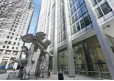
28 Liberty Street

When it comes to the upkeep and maintenance of New York City's world-famous buildings and skyscrapers, the men and women of Local 94 are truly the unsung heroes. A perfect example of this is the colossal 28 Liberty Street, once known as One Chase Manhattan Plaza.